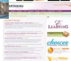
Consultant Business Center 24/7