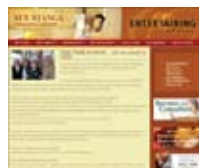
Your Own Web Page*